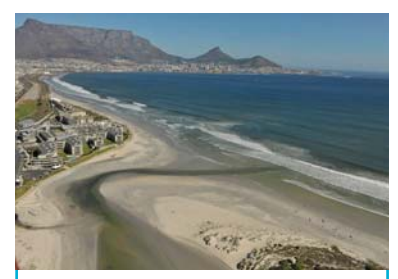
Life's a beach: Cape Town's 307 km coastline has more than 70 beaches.

NgoSuku lwaMagugu naMafa iKeizersgracht eseDistrict Six yathi yathiywa ngokutsha ngegama