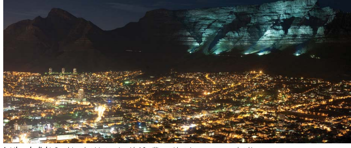
Let there be light: Supplying electricity to a city with 4,2 million residents is an enormous undertaking.

All three tariffs have two pricing blocks with usage thresholds. If you cross the