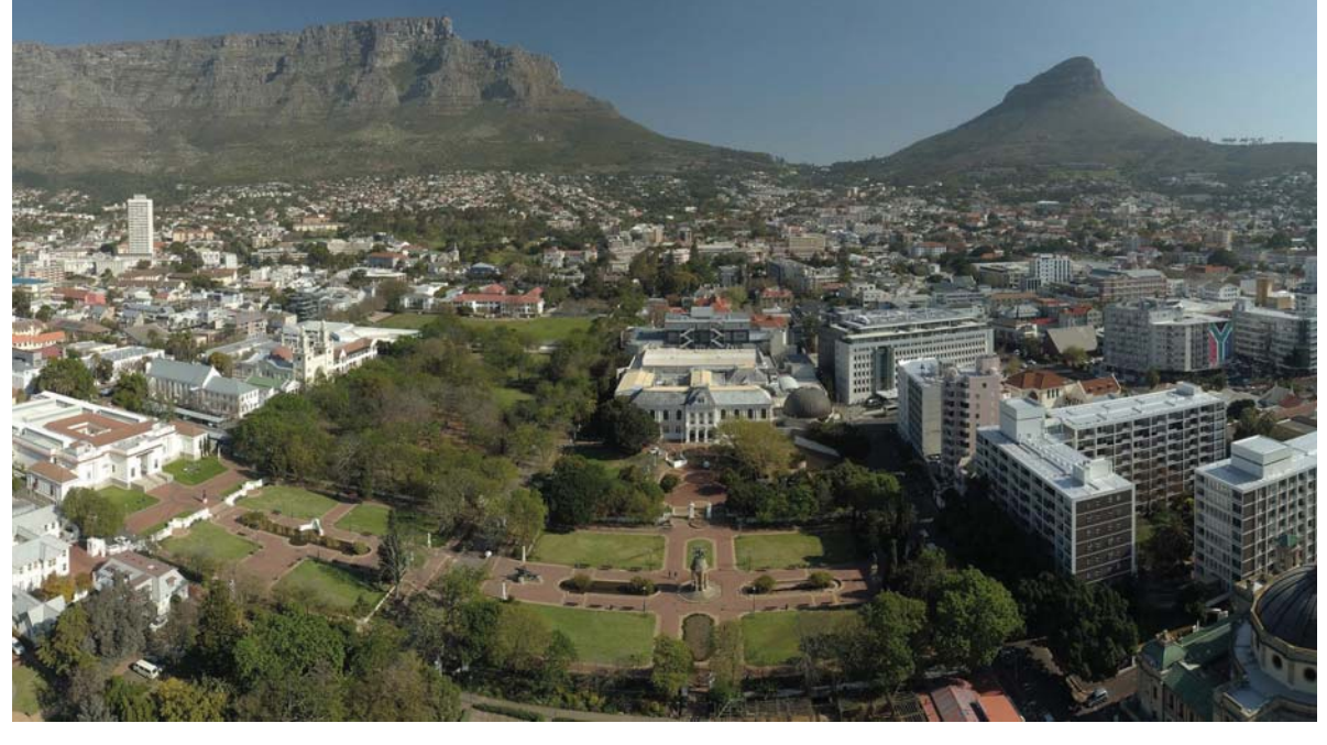
Great green heart: The Company's Garden is a great place to visit this summer. Packed with rare and exotic plants and a fascinating history, ringed by museums and galleries, this green heart of the city is a must-see. It's free to enter and open daily between 07:00 and 19:00.

In the previous financial year, R7,3 million was spent on a new roof, wall cladding, waterproofing and water connections, and ablution facilities. This financial year, R20 million will be spent on, among others, security access and stone-guards, electricity and lighting, dry-walling, painting, parking and landscaping.