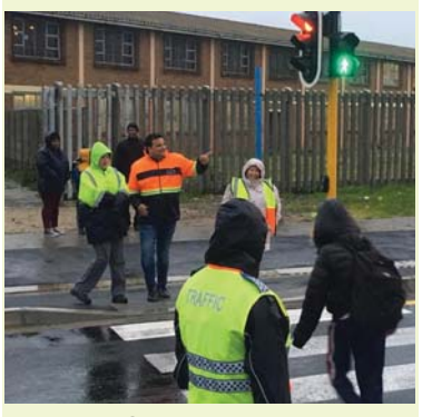
Smart tech: The Tafelsig Primary School crossing is state-of-the-art.

• Please report traffic signal faults to 0800 656 463 (24 hours).