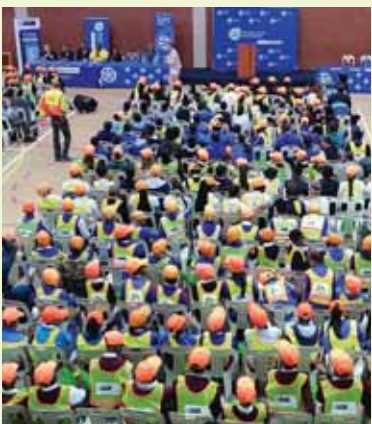
Thank you: Scholar patrol members were honoured at Belhar sports centre.

The Road Traffic Management Corporation is responsible for the implementation of scholar patrols country-wide, and Province's Public Works Department partners with the City and other local authorities to train and monitor scholar patrols.