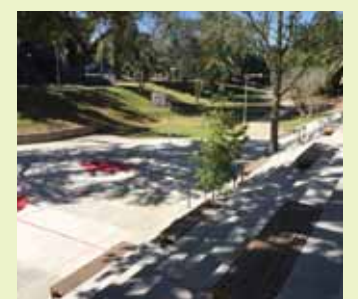
Spectator sports: The new amphitheatre at Elizabeth Park also serves as a basketball court.

Elizabeth Park has a rich history and was opened in June 1953. In 1968, a culvert was erected over the Elsieskraal river, where a bridge was built to access each section of the park. A storyboard at the entrance to the park depicts the history and early days of this green space. The total cost of the project is R18 million.