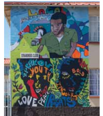
Amazing art-scape: Residents are invited to enter a mural competition.

The R20 million project is scheduled to be completed by July 2020.