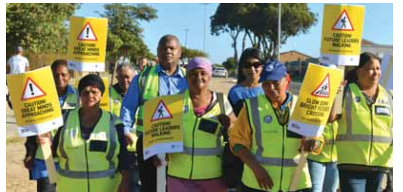
Safety in numbers: The Walking Bus project, started in May 2016 by Mayor Dan Plato when he was Western Cape Community Safety minister, is now active in 55 areas across the city, with an additional 20 areas to follow soon. The Walking Bus campaign has seen thousands of parents become volunteers, ensuring that school children have safe passage to and from school. This is especially important in areas affected by crime and gang violence.

District SDFs, which will guide future decisions about developments and land use, will be finalised after further rounds of public participation in 2020 and 2021.