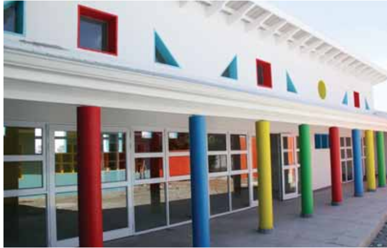
Investing in the young: The new Heideveld Early Childhood Development Centre.

In Area Central, other projects on the horizon include the extension of the pharmacy at the St. Vincent clinic in Belhar; the in-house planning phase for new regional libraries in Nyanga and Manenberg; upgrades to the Hugo Lambrechts auditorium, Rust-en-Vrede, Goodwood and Parow