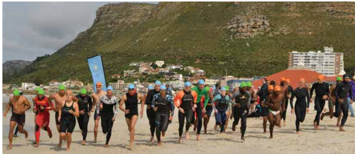
Fit for purpose: In preparation for the summer season, seasonal lifeguards underwent a two-day induction at Muizenberg.

The number of beach visitors can reach 1,5 million during the peak season from October to March each year. In December and January, daily beach visitor numbers