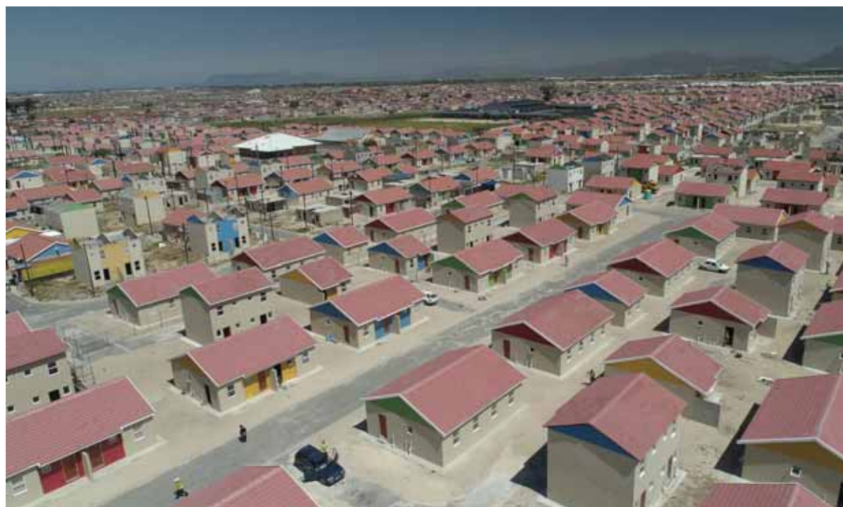
Developing Delft: More than 808 houses of the 2 112 planned Breaking New Ground (BNG) housing opportunities in the City's R185 million Delft housing project have been handed over. BNG projects are funded by National Government and implemented by the City.