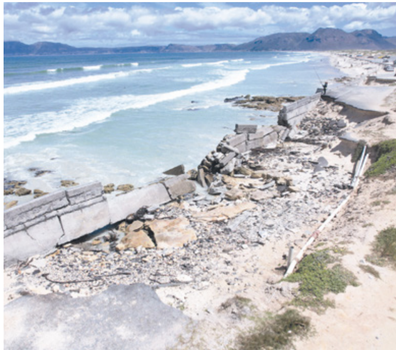
Pep up the pavilion: Fisherman's Lane at Strandfontein Pavilion is undergoing reconstruction and upgrades that will turn this iconic facility into an even-better recreational spot.

Improvements will include the reconstruction of the road linking the eastern and western parking areas, and an upgrade for the braai and picnic facilities. A boardwalk and walkways will be installed to improve access for visitors. The recreational area will be landscaped using natural vegetation found in the area and will include the installation of play equipment and an irrigation system. In addition, the rock revetment will be extended along the eastern parking area and will include a beach access stairway. A section of the western parking area will be cut back, and a gabion will be constructed as further protection along the exposed coastline. New lighting will be installed.