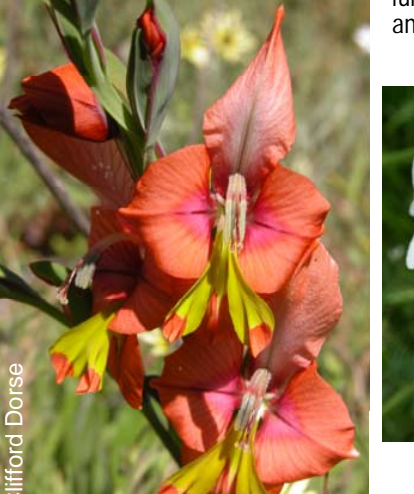
Blue-eye Uintjie (Iris Family)

backdrop to the city bowl, functioning as a green lung and a scenic grassland.