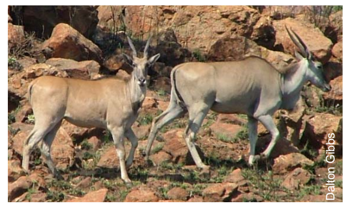
Large game such as Eland used to occur in Renosterveld