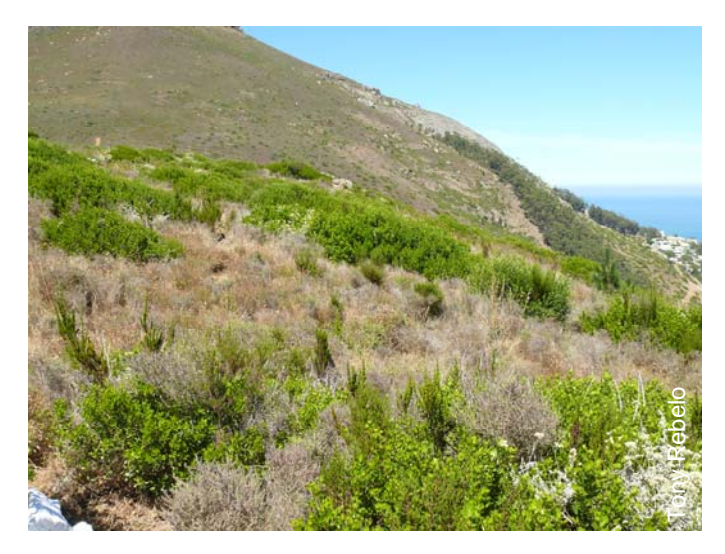
Grasses - here Red Grass - can dominate in Renosterveld as does the dominant shrub, the Wax Karee

Benefits: PSR is confined to two blocks in Table Mountain National Park. These are the only areas on the Peninsula where the big game that used to occur here historically, can be restored. All the other areas are either too developed (Granite Fynbos) or too nutrient poor (Sandstone Fynbos) to support large game. Many Renosterveld species are aromatic and also probably have unrealised medicinal value. Apart from recreation (hiking, dog walking, botanising and spiritual revitalisation) natural areas of PSR provide the immediate