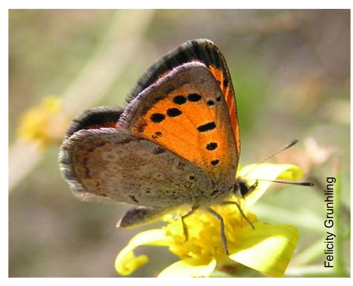
Western Sorrel Copper

What can be done to prevent PSR from becoming more threatened? Degraded areas need to be restored by reintroducing grazers where they have been lost. Large portions of Signal Hill have also been protected from fire for up to 25 years. It has been suggested that Nguni Cattle or Boerbokke might be used as amenable substitutes for eland and rhinoceros, as introducing large game poses problems in an urban conservation area that is used by hikers, and that is also unfenced in many areas. At Devils Peak, a more natural grazing regime with no mowing needs to be restored, and bulbs and shrubs reintroduced. The area should also be burnt more often.