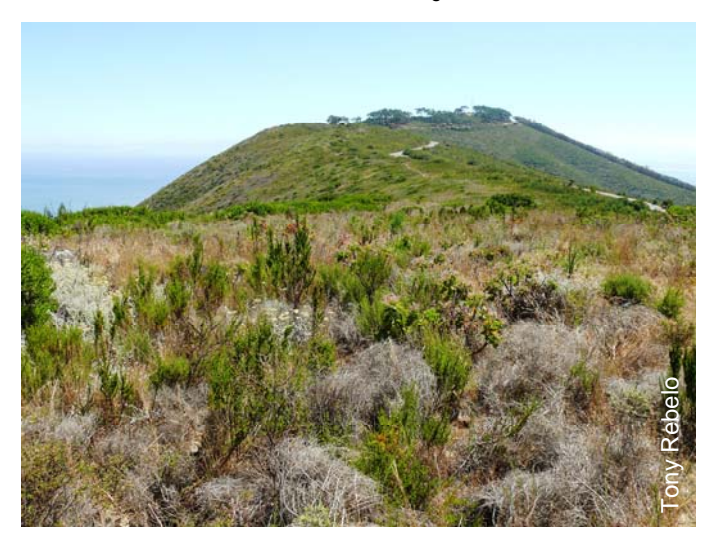
Renosterveld on Signal Hill

Geology and soils: PSR occurs on fertile clay soils derived from shale of the Malmesbury Group's Tygerberg Formation. Soils are clayey, often shallow, and rock-hard in summer. The contact zone between the granite and shale at Mouille Point is a national monument, where the melting and breaking of the shale into the molten granite 500 million years ago have been frozen in time. The contact between the granite and shale is very narrow and runs up over the neck of Lions Head, and straight across to the saddle