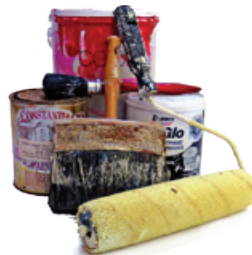
Old paint and brushes