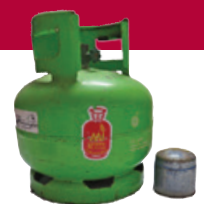
Explosive and compressed waste: for instance gas cylinders