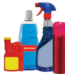
Chemical waste products (air fresheners, all-purpose cleaners)