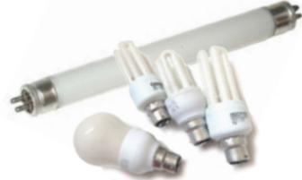
CFL (compact fluorescent lamps) and other discharge lamps