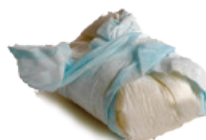
Sanitary waste: soiled disposable nappies and adult diapers