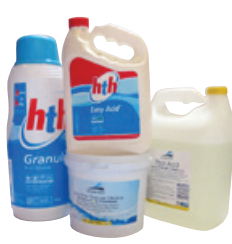
Swimming pool chemicals