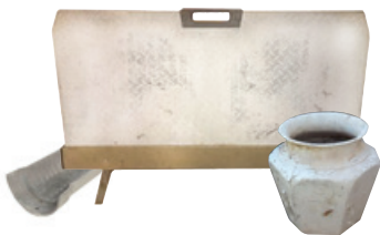
Asbestos waste material: limited to plant containers, gutters or old cement heaters - No bulk waste will be accepted.

The following will be accepted as hazardous household waste: