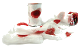
Medical waste: blood-stained bandages and plasters, expired pharmaceuticals