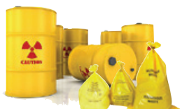
Bulk hazardous household waste from residents' homes, offices or businesses