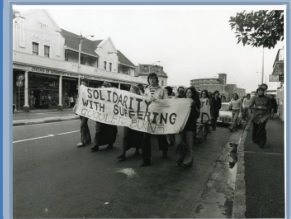
1976 Observatory to Mowbray student protest march