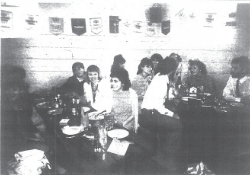
The Helderberg Tavern at Station Road Observatory is a popular student watering hole and steakhouse where you can get a 300g grilled steak for R7 and a whole grilled crayfish for the same remarkably low price. To book telephone (021)471919.