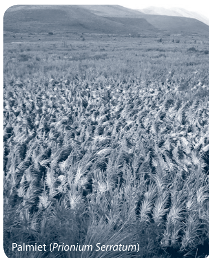
Palmiet ( Prionium Serratum )

One example would be palmiet ( Prionium Serratum ), which is a specially adapted plant commonly found in the Southern and Western Cape river systems. It is characterized by fibrous, net-like root systems and woody stems which are very effective at trapping sediment and reducing the velocity of waters in flood. This unique plant is also referred to as the superglue of the Western Cape rivers. However, palmiet is not only associated with rivers, but can also form extensive Valley Bottom wetland systems, which are often underlined by peat.