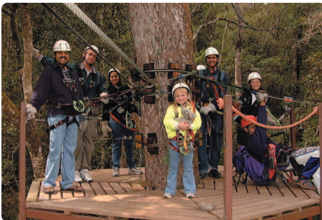
Treetop Canopy Tour in Tsitsikamma National Park.