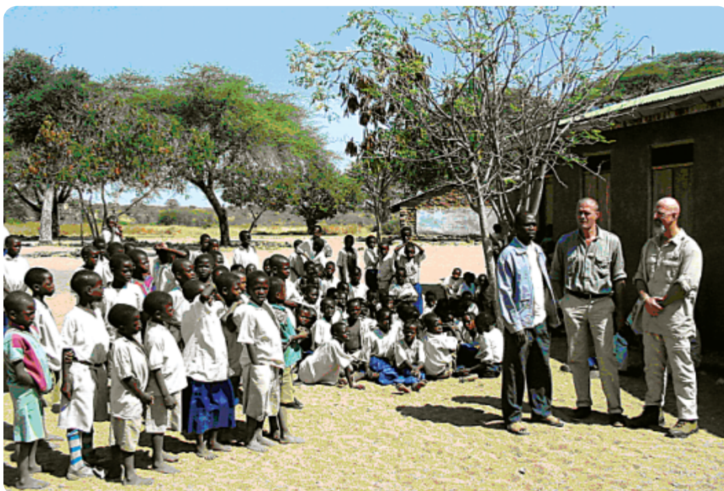
Ker & Downey representative and PPT facilitator visiting neighbouring villages in Tanzania.

"If the acquiring of the investment is challenging, then the downstream management is even more difficult. ... As with any relationship, simple and effective communication is critical. This needs to happen at a senior level." (Tourism PPP Toolkit task team, 2005: Report 1: 21)