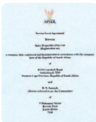
Service level agreement between Spier and Klein Begin laundry.