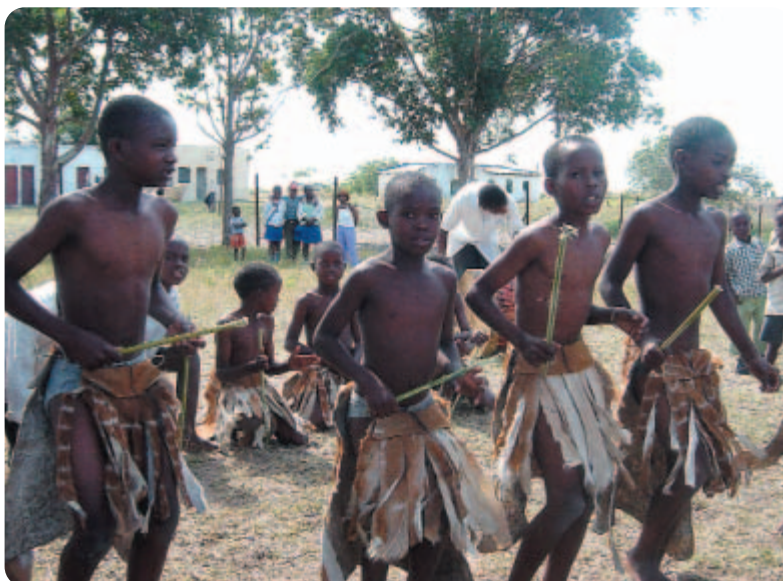
Children at Mqobela School, KwaZulu-Natal