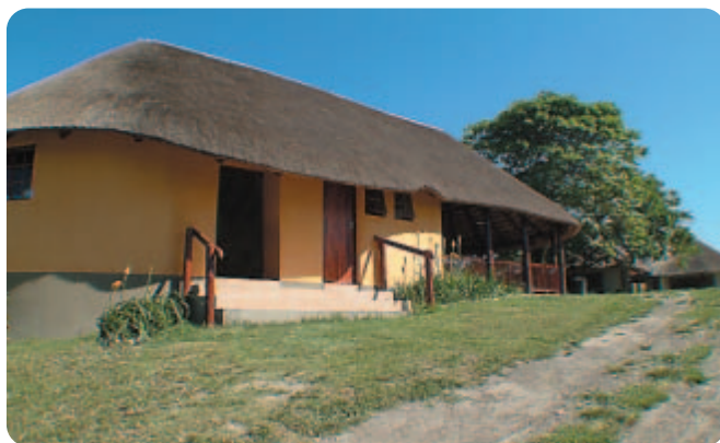
Mbotyi River Lodge and the Imvelo Award, won partly due to the campsite partnership

At the same time, do not isolate the partnership from the business. Partnerships cannot be pursued in total isolation from operations. They relate to the goals of the company, management approach, the way staff behave, the product on offer, and how it is marketed. Management and staff therefore need to be able to incorporate a partnership approach into their work. This will require careful management of internal change, to ensure all players understand the approach and are equipped to fulfil their roles, Brief 4 .