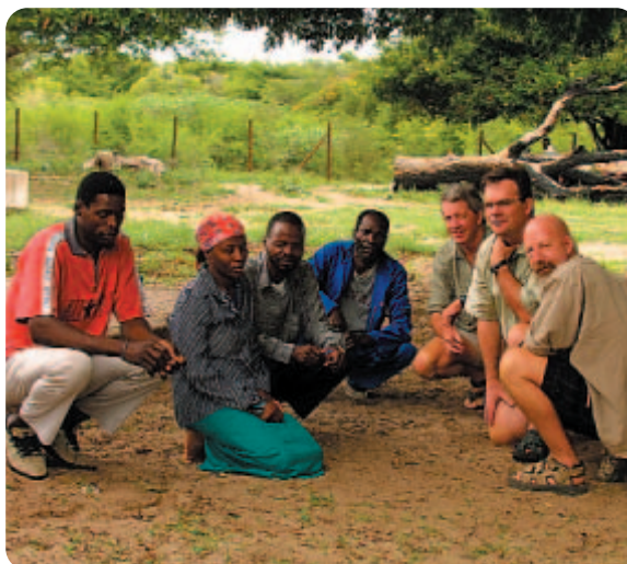
Wilderness Safaris management and PPT facilitator meeting representatives of a partner community.

The dti has initiated a Community Public Private Partnership (CPPP) programme aimed at reviving rural economies through PPPs in a variety of sectors including tourism. It has developed guidelines on CPPPs, instituted a loan finance scheme to assist communities in preparing business plans and other material to attract investment, and is actively promoting joint venture partnerships for tourism.