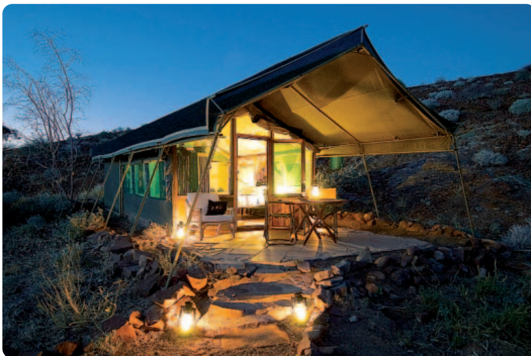
Guest tent at the award-winning Damaraland Camp

Expect the community to take time to commit.