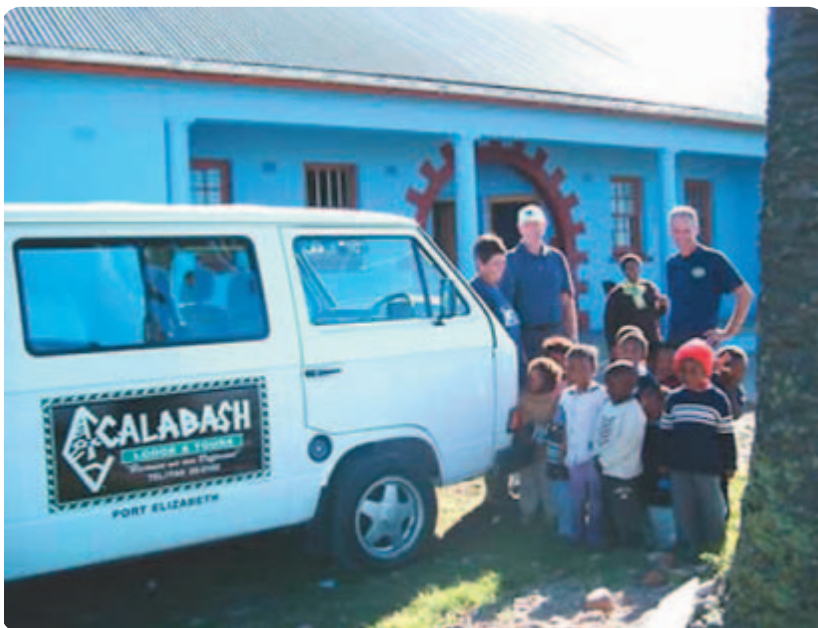
Calabash Trust supports local schools.